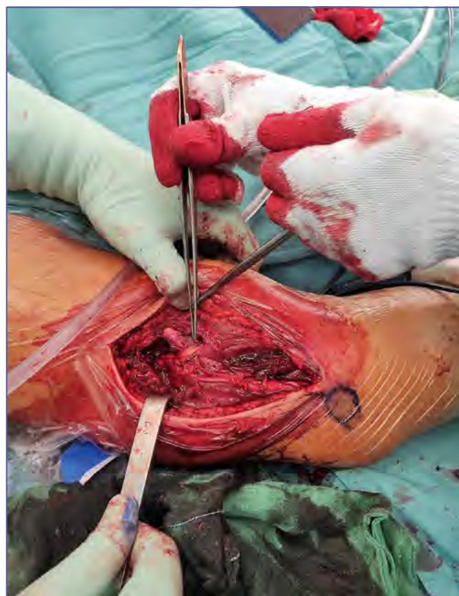
Figure 2. Humeral distal fracture with radial nerve palsy, intra-operative clinical photo.

These examinations do not have a role in the acute setting, but can be helpful to determine baseline nerve function after 4 weeks because this is usually the time required for pathologic potentials of muscle denervation to develop. If over more than 4 weeks fol-