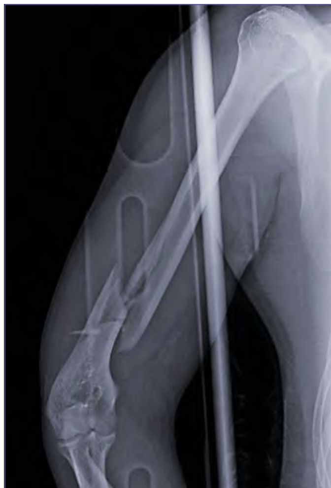
Figure 1. Humeral distal fracture with radial nerve palsy. Pre-surgery X-ray.

After surgery nerve recovery must be monitored, performing complete physical examination that consists of sensory and motor evaluation of the ulnar, median, and radial nerves along with electrodiagnostic study.