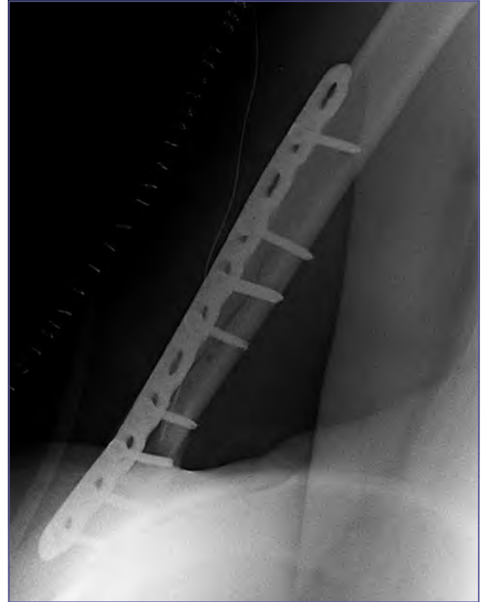
Figure 4. Humeral distal fracture with radial nerve palsy, X-ray post-surgery AP.

low-up EMG shows a polyphasic wave, meaning larger polyphasic motor unit action potentials of longer duration, this is indicative of an attempt at recovery, otherwise it is a negative prognostic factor. In addition to monitoring, it is useful to use a brace to avoid hand drop, electrostimulation 25 of denervated muscles, and the use of neurotrophic drugs/supplements 26 .